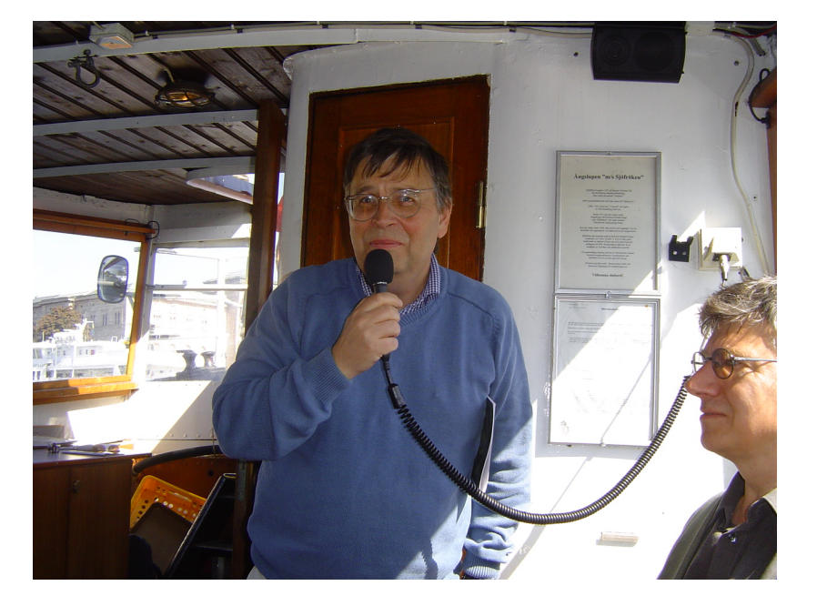
Excursion during the Viro Conference, 2008-05