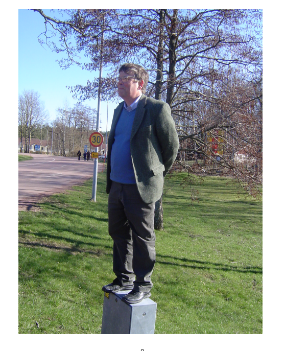
Nordan 12, Åland, 2008