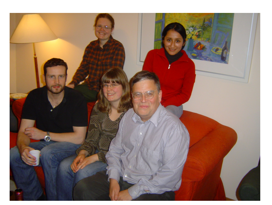
◆□▶◆□▶◆臺▶◆臺▶ 臺 釣९()