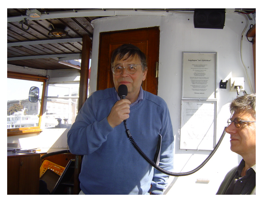
◆□▶◆圖▶◆臺▶◆臺▶ 臺 釣۹@