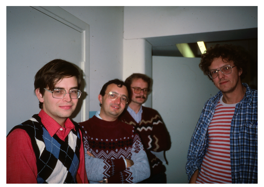
1983 November, Uppsala