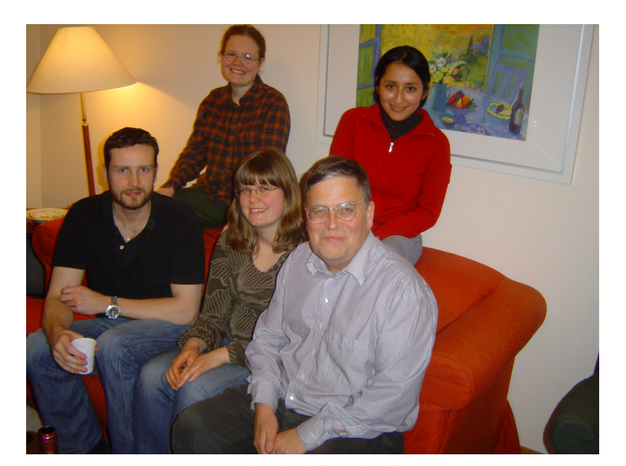
2008, Institut Mittag-Leffler