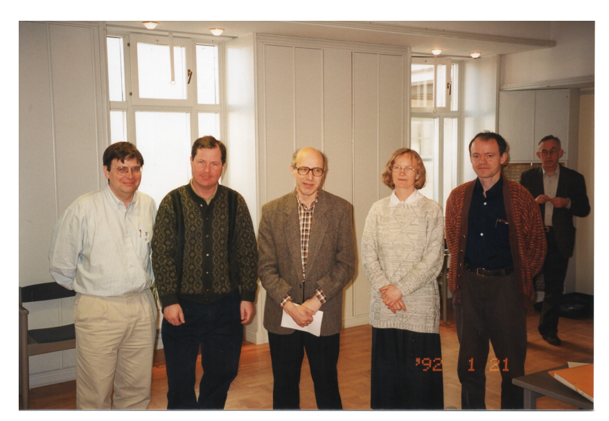
1997 March, Trosa