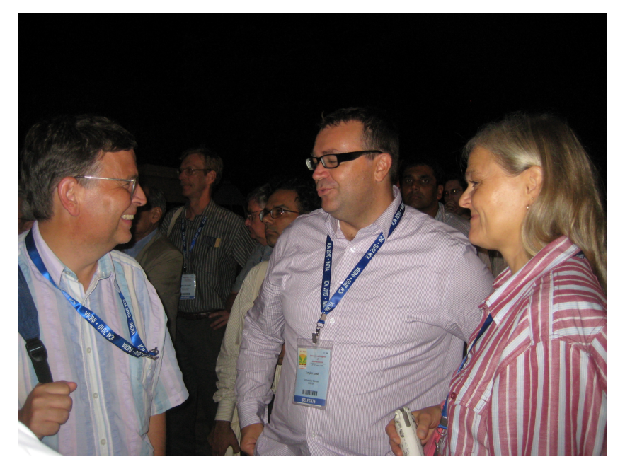
2010 August 21, Hyderabad