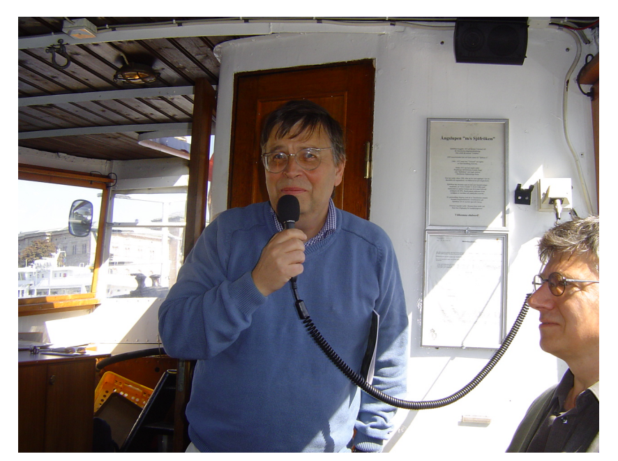
2008 May, Conference in honor of Oleg Viro