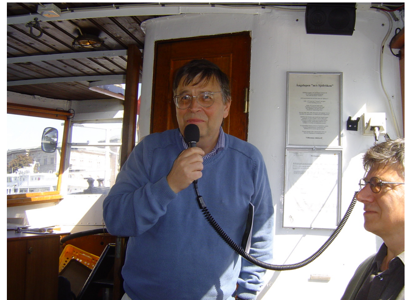
Excursion during the Viro Conference, 2008-05