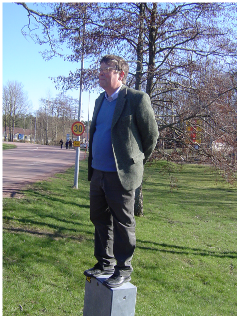
Nordan 12, Åland, 2008