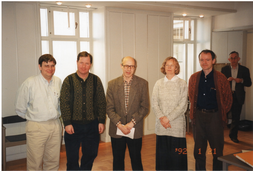
1997 March, Trosa