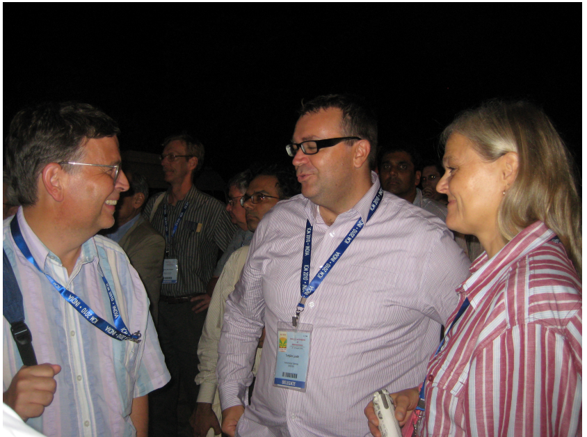
2010 August 21, Hyderabad