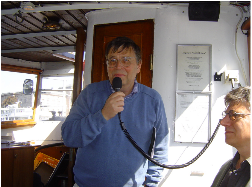
2008 May, Conference in honor of Oleg Viro