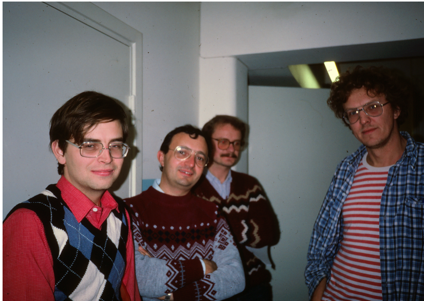
1983 November, Uppsala