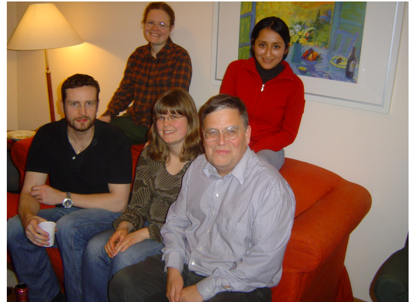
2008, Institut Mittag-Leffler