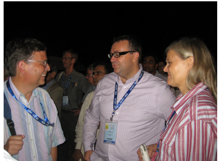
2010 August 21, Hyderabad