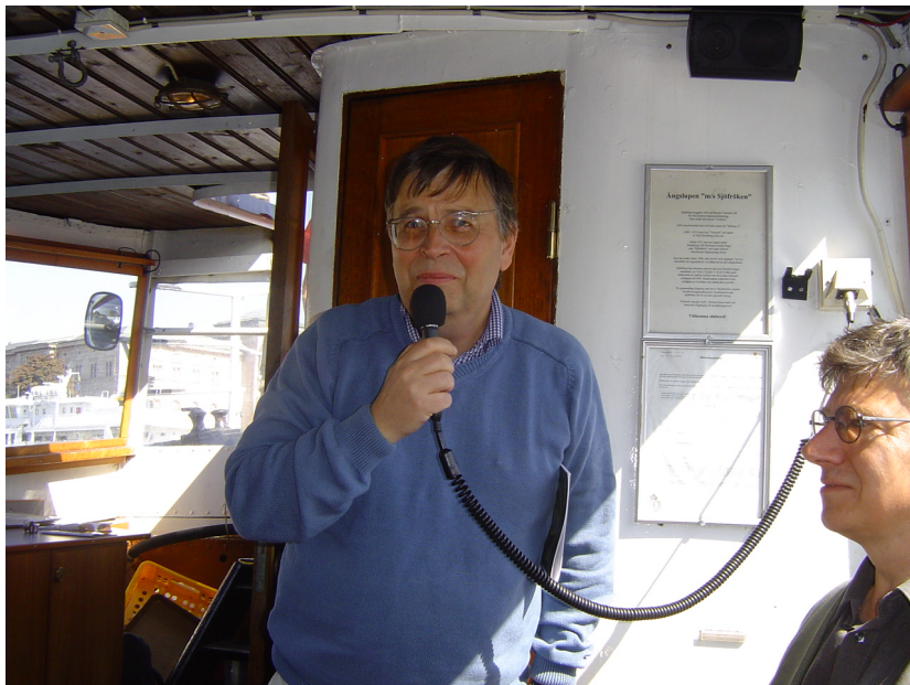
2008 May, Conference in honor of Oleg Viro